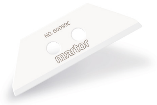
CERAMIC BLADE NO. 60099C

According to cutting application and preference, the new CERAMIC BLADE NO. 60099C can be used in place of, among others, the TRAPEZOID BLADES NOS. 99 and 60099. Like its steel counterparts, the CERAMIC BLADE NO. 60099C has 2 cutting edges.